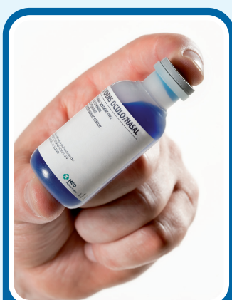
Shake the vaccine solution.