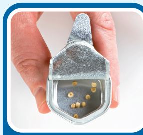
Vaccine spheres will develop a brown colour, stick to the cup and not dissolve anymore, if they are opened before they are required.