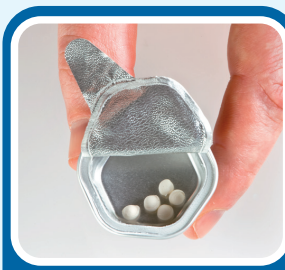
Vaccine spheres just after opening.

The vaccine spheres will absorb moisture from the environment, develop a brown colour, stick to the cup and not dissolve anymore. If the cups are kept open for a long time, the vaccine spheres will shrink.