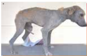
Day 0 – fluralaner treatment